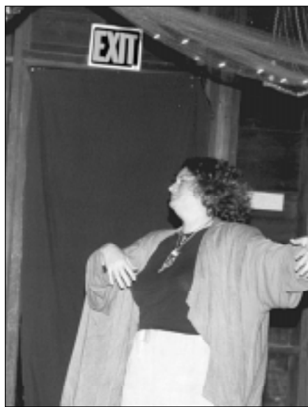
An unidentified Witchcamper trances out and slips towards the Exit of No Return — just one of the many dangers of Witchcamp, according to the Surgeon General.

Rumors that all of Reclaiming's in-person rituals are being cancelled were dismissed by Money. "We will continue to cater to pedestrians for at least another few months."