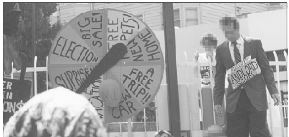
In a controversial move, Reclaiming replaced the ancestor's trance at the 1998 Spiral Dance with The Big Spin. "The only problem," said an organizer who asked to remain anonymous, "was a lot of grumbling from the losers. But isn't that always the case?"