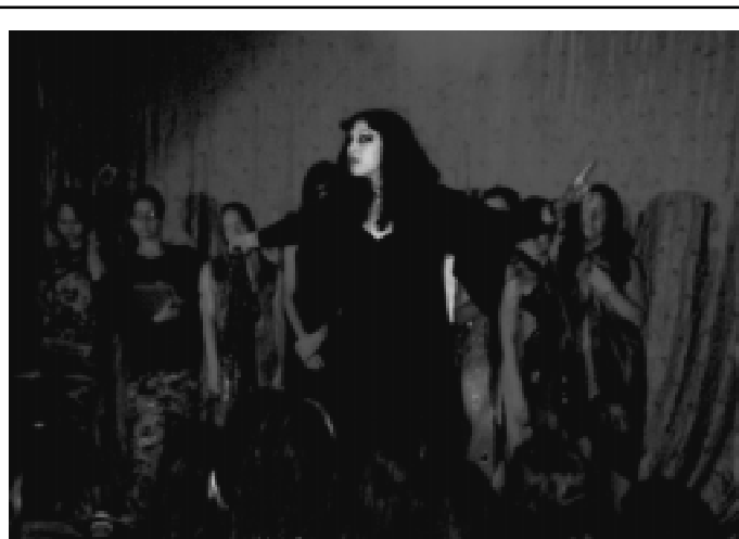
A NEAR-RIOT erupted at the Ms. Witchcamp 1998 competition at California Camp. Above, Goth Witch's rendition of demonic poetry upstages Trendy Witch's handcrafted costume. When Hippie Witch invoked the spirit of Jerry Garcia, the audience had to be restrained from storming the stage.